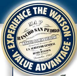
WATSON BUILDING 202 SITE PLAN