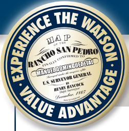
WATSON BUILDING 184.2 SITE PLAN