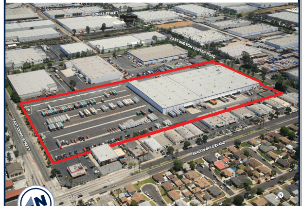
Building 114 located within red border