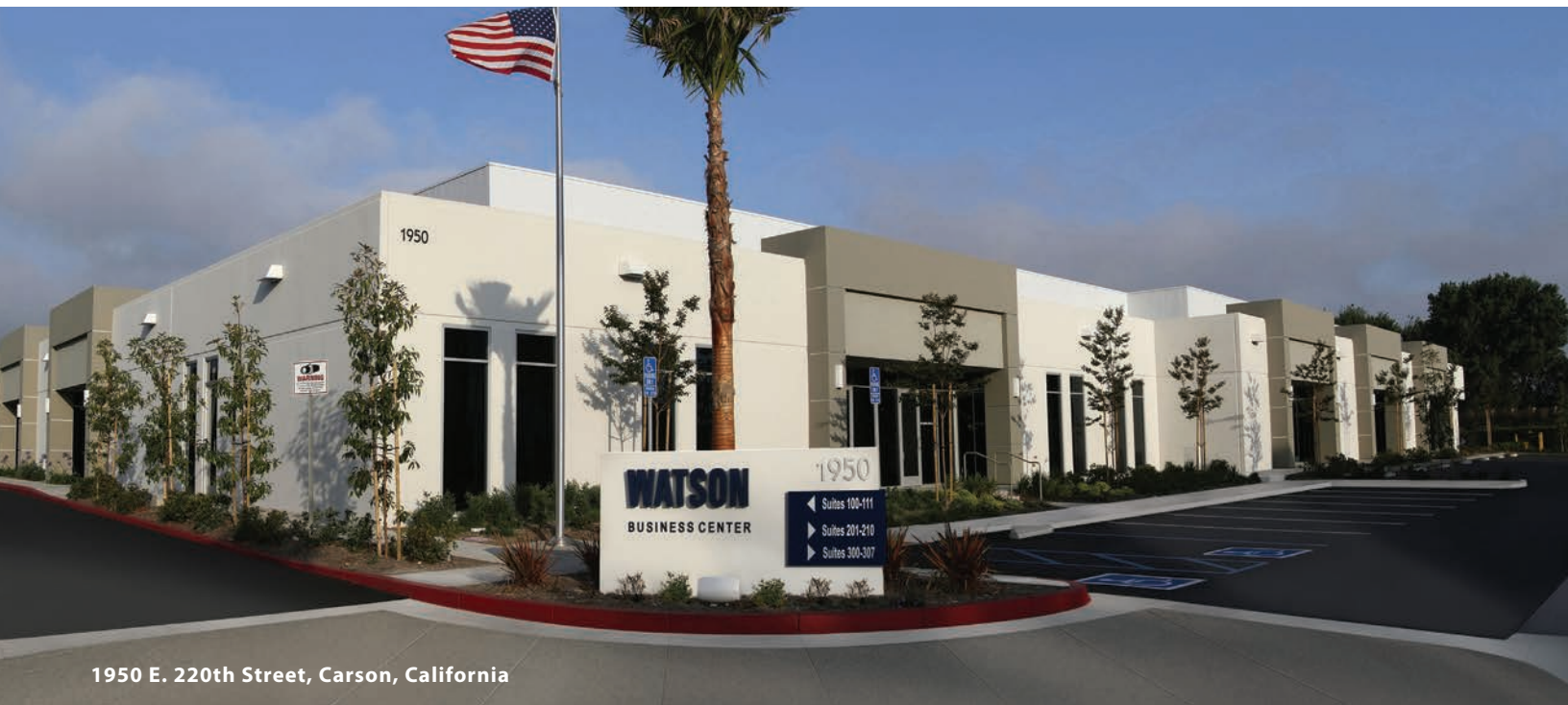
1950 E. 220th Street, Carson, California