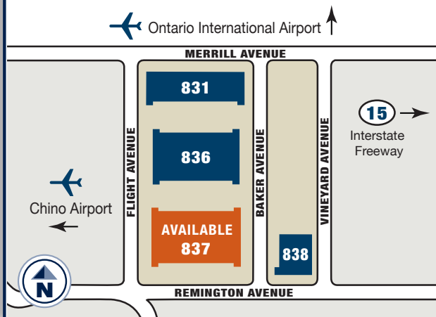
WATSON INDUSTRIAL PARK CHINO

The information on this brochure has been compiled for the internal administrative convenience of Watson Land Company. Watson Land Company makes no representation or warranty, express or implied, as to the accuracy of this brochure. This brochure may not reflect all building improvements or as-built conditions. The information contained herein and on any other materials with which it is presented is not an offer and is subject to change without notice. Tenants should make their own independent investigations of all facts and assumptions on which they might rely in making a decision to lease property from Watson Land Company.