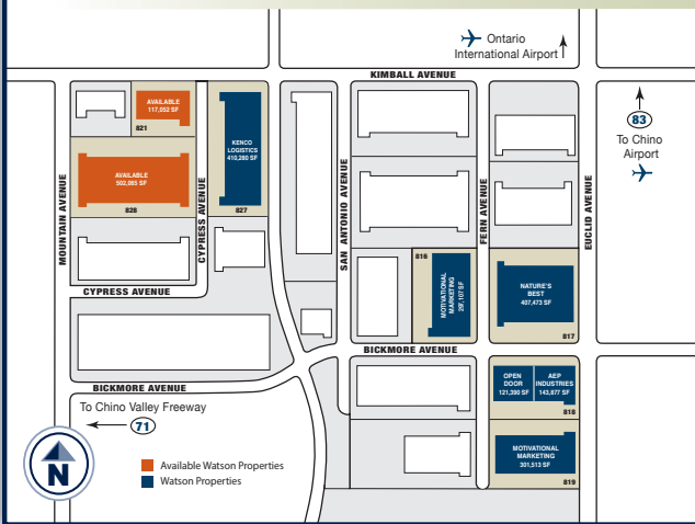
WATSON COMMERCE CENTER CHINO

The information on this brochure has been compiled for the internal administrative convenience of Watson Land Company. Watson Land Company makes no representation or warranty, express or implied, as to the accuracy of this brochure. This brochure may not reflect all building improvements or as-built conditions. The information contained herein and on any other materials with which it is presented is not an offer and is subject to change without notice. Tenants should make their own independent investigations of all facts and assumptions on which they might rely in making a decision to lease property from Watson Land Company.