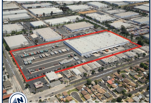
Building 114 located within red border